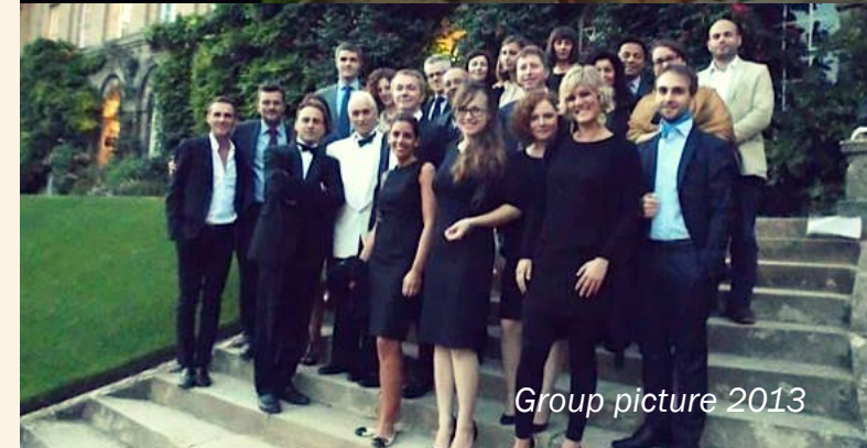
Group picture 2013