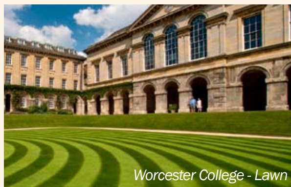
Worcester College - Lawn

You are invited to join an intensive 6-day learning experience designed to enhance your English communication skills and give you greater confidence in dealing with foreign companies, colleagues and clients.