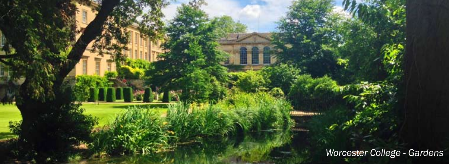
Worcester College - Gardens