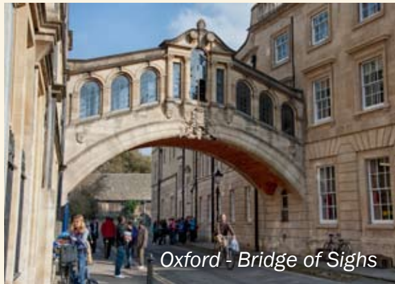
Oxford - Bridge of Sighs

The summer program will take place at Worcester College , one of the most beautiful and prestigious colleges in the University of Oxford. Founded in 1714, it is a happy blend of ancient and modern architecture. Its 26 acres of beautiful gardens and grounds provide a secluded environment, with lakeside walks and a large sports ground.