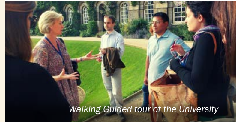
Walking Guided tour of the University