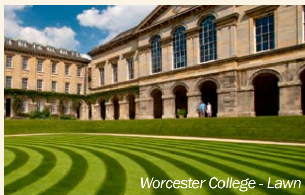
Worcester College - Lawn

You are invited to join an intensive 6-day learning experience designed to enhance your English communication skills and give you greater confidence in dealing with foreign companies, colleagues and clients.