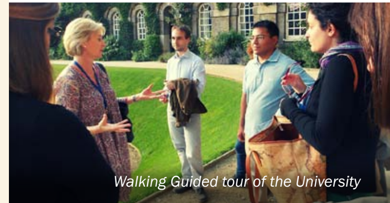
Walking Guided tour of the University