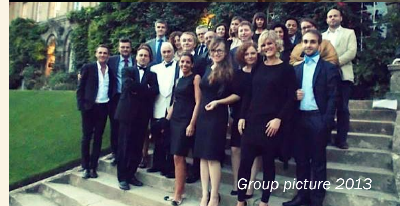
Group picture 2013