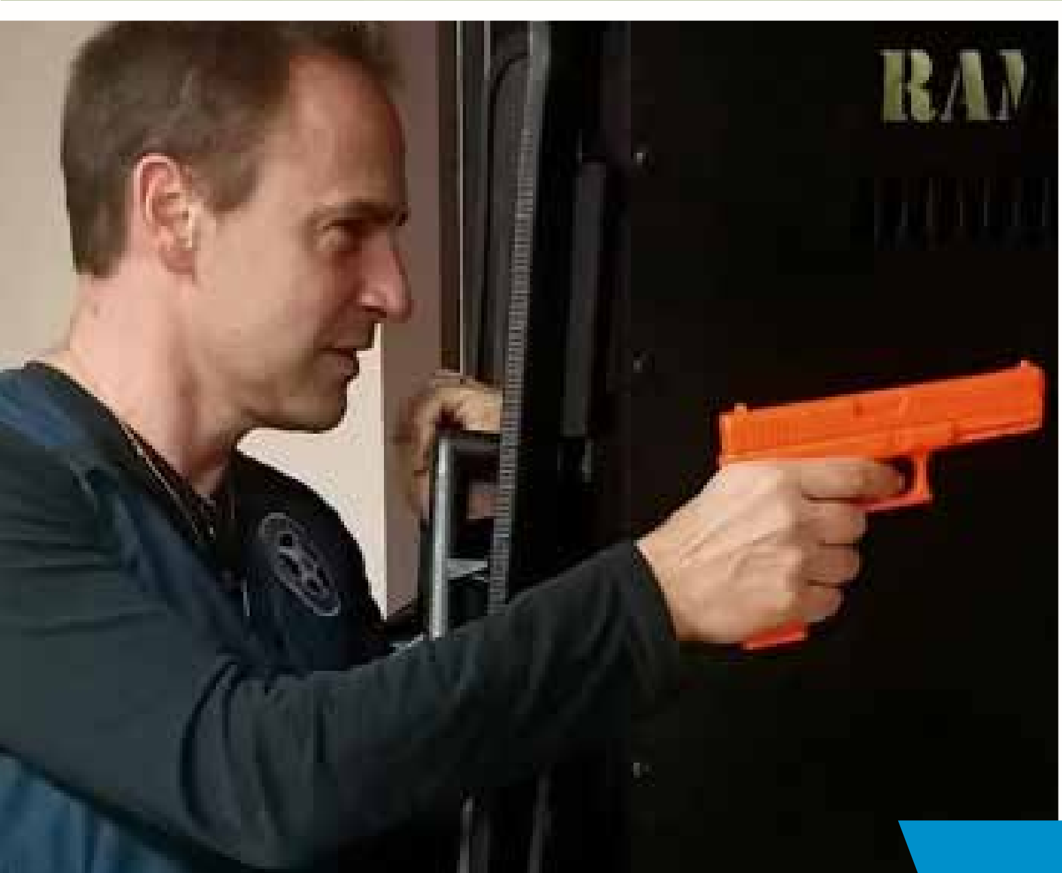
Home of the Phillies